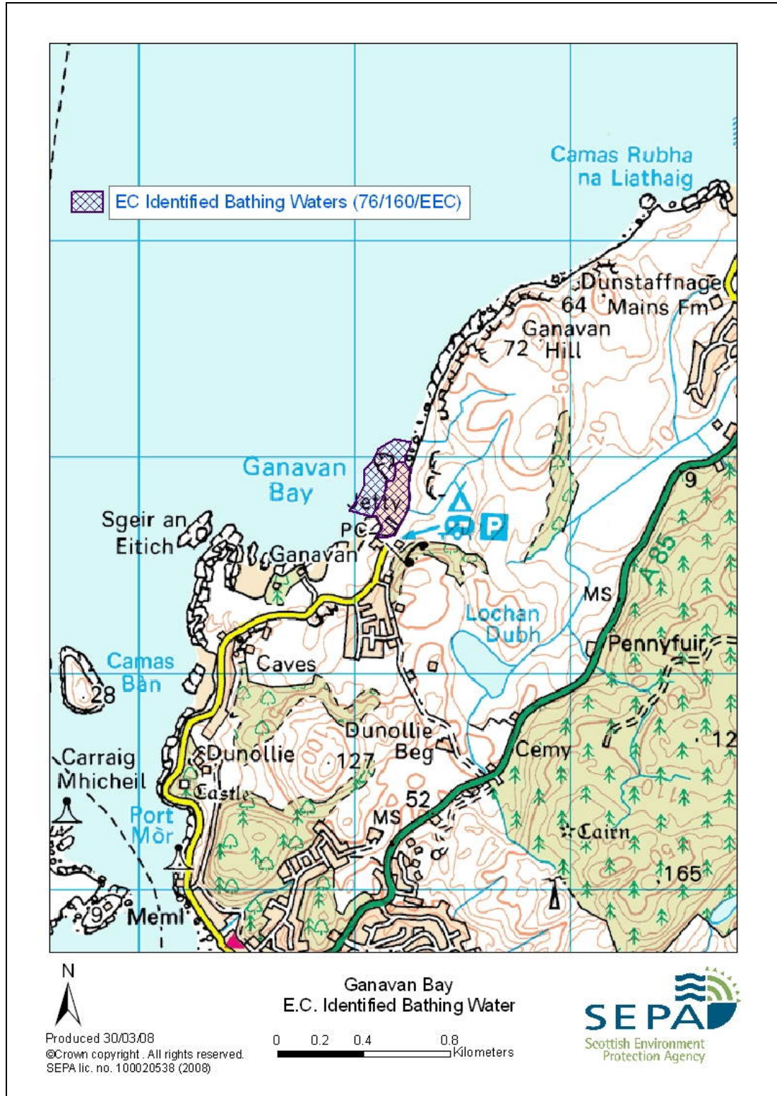
Figure 17A: Map of the Ganavan Bay designated bathing beach and surrounding local area.